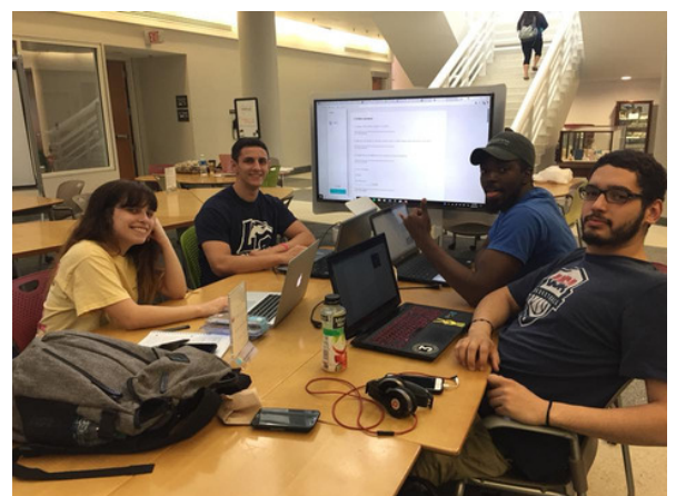
Students use the new media:scapes

The atrium has been painted, now displaying a bold stripe of Longwood blue, and half of the atrium has been carpeted to help with echoing in the large space. The taskforce is excited to continue its mission to create better spaces throughout the library.