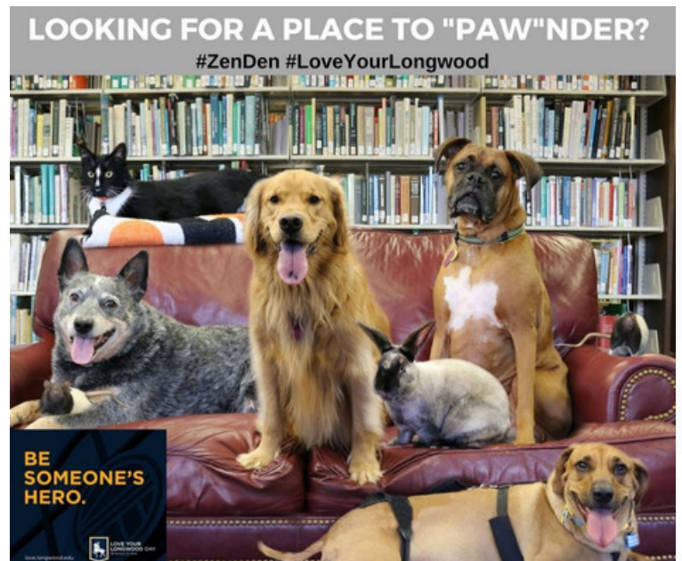
A library ad for Love Your Longwood Day.

Numerous events highlighted our partnerships with Longwood departments and the community at large. We held two very popular genealogy events highlighting our resources and providing training by Greenwood staff as well as trained professional genealogists.