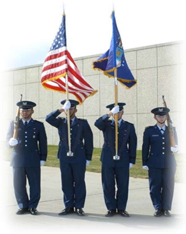
Cadet Honor Guard

Honor Military Junior Reserve Officer Training Corps (JROTC) Schools and Air Force Reserve Officer Training Corps (AFROTC): Honors with Distinction military schools are designated by the Department of the Air Force, Army, Marine Corps, and Navy to nominate USAFA candidates annually from among their honor students. Each honor unit may nominate five students to compete for the vacancies. Five students from each AFROTC detachment may be nominated to compete for the authorized vacancies. Air Force ROTC students should apply for a nomination to their professor of aerospace studies or aerospace science instructor who will recommend nominees to the head of the institution where the candidate is currently enrolled.