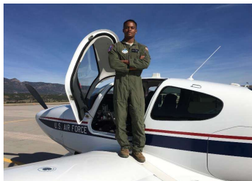
T-53 (Cirrus SR20)

These individuals are the subject matter experts on the USAFA application process. They will serve as your point of contact for questions directly related to all components of your application, except for DODMERB and medical concerns. Keep in touch with your Admissions Counseling Team to ensure your file is complete and current. The contact information of your Admissions Counseling Team can be found on your USAFA application portal.